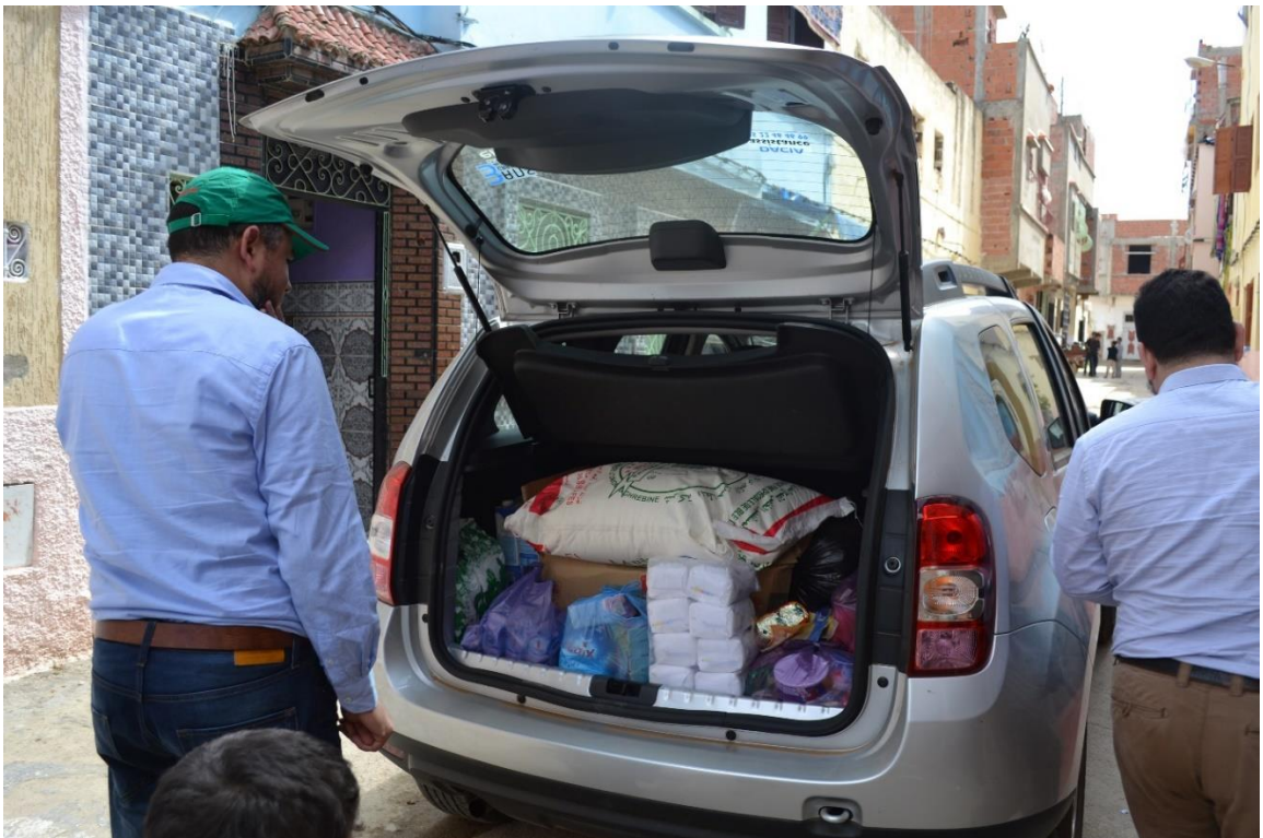
Figure 2: Example of food packet distributed to a poor family

Figure 2 and 3 show an example for food packet distribution.