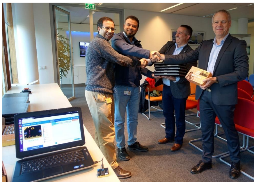
Figure 23: SNMV receiving laptops and micro-bit chip from NXP semiconductors

We presented our project at the event organized by “ Samen voor Eindhoven” at the high tech campus Eindhoven. Also, we presented our project at the voluntary day event organized by Expats the 25 of November at Holliday Inn, Eindhoven. Additionally, we presented our Mobile Laboratory program to NXP Semiconductors and have been granted a sponsorship of our activities with 30 Laptops and 30 Microbit chips. Figure 24 shows the donation that is received by SNMV from NXP Semiconductors.