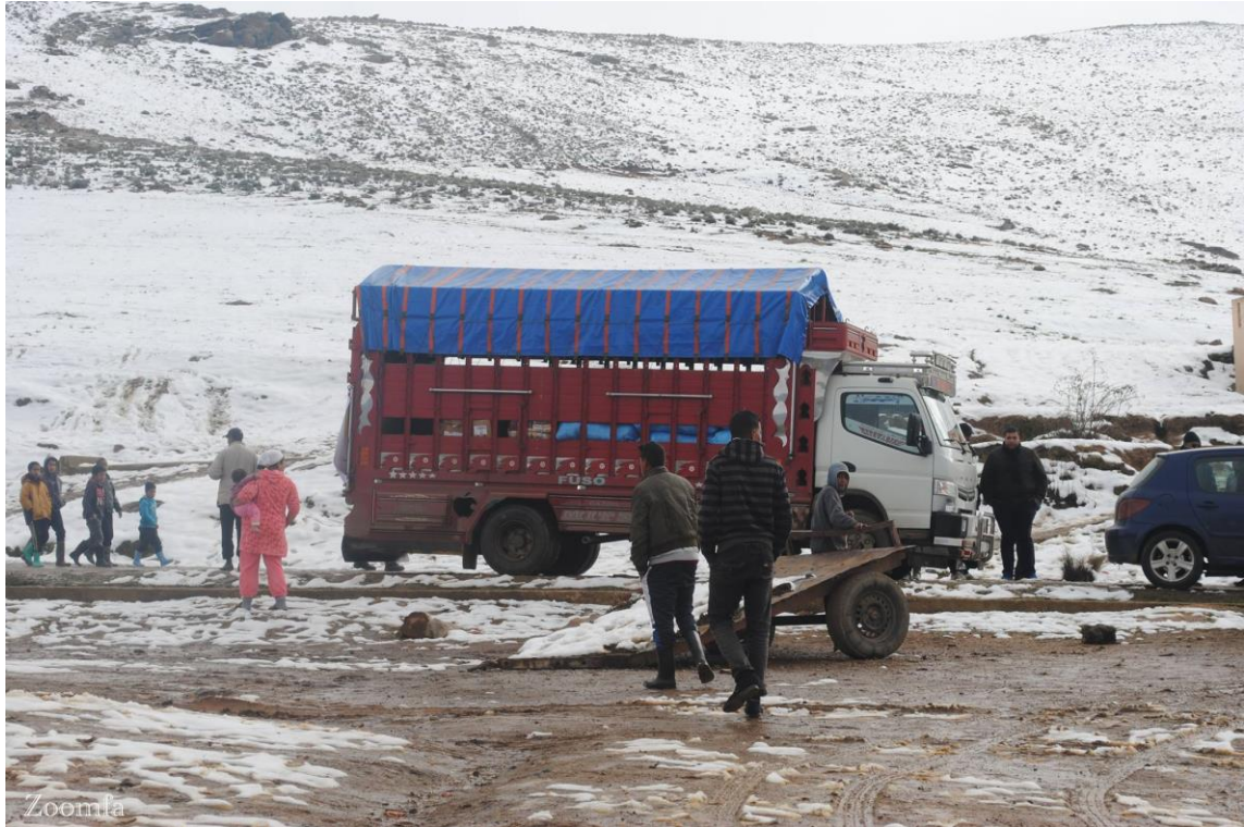
Figure 22: Example of the effort reaching mountains during the winter, example atlas mountains