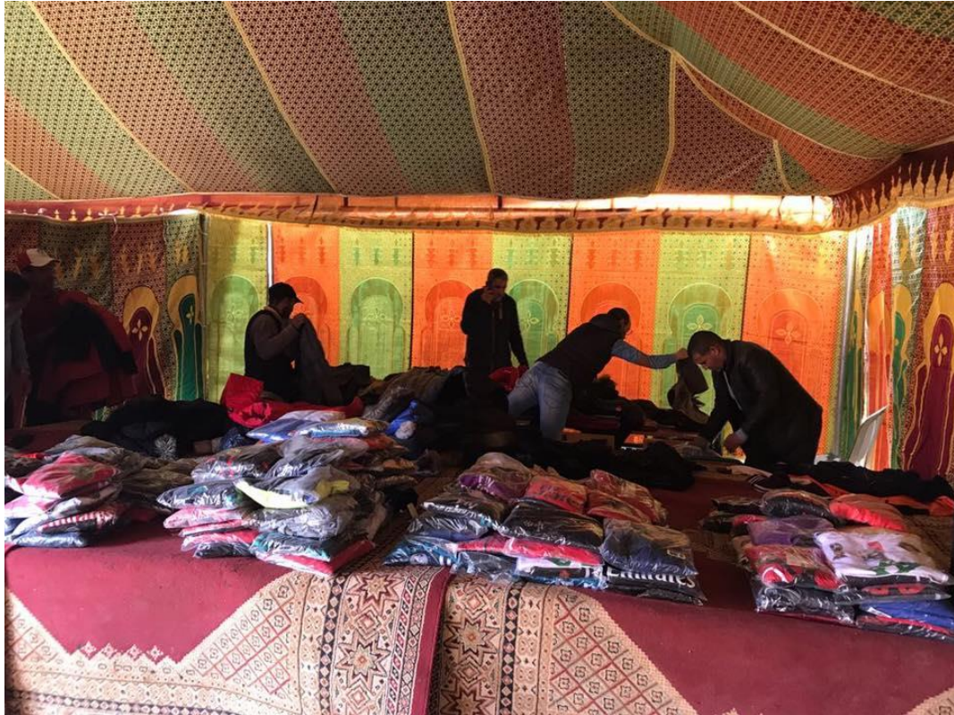
Figure 7: Preparation of the distribution of clothes to children at Sghour Rhamna