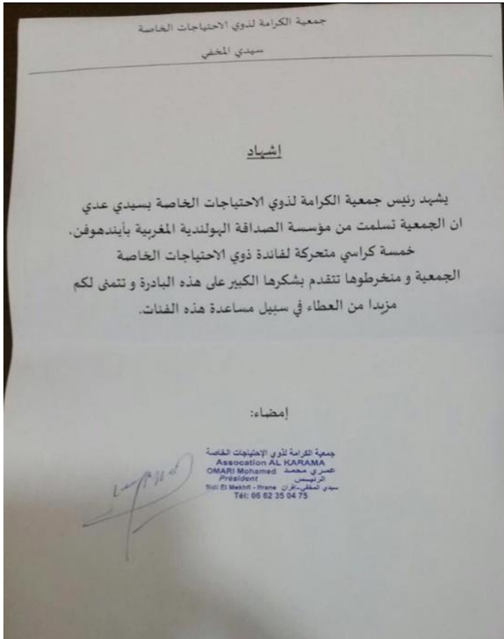
Figure 20: Distribution of wheelchair to handicapped