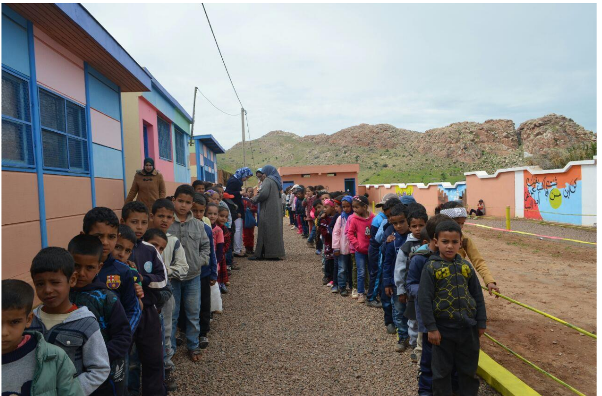
Figure 13: Long list of children one by one row for clothes distribution