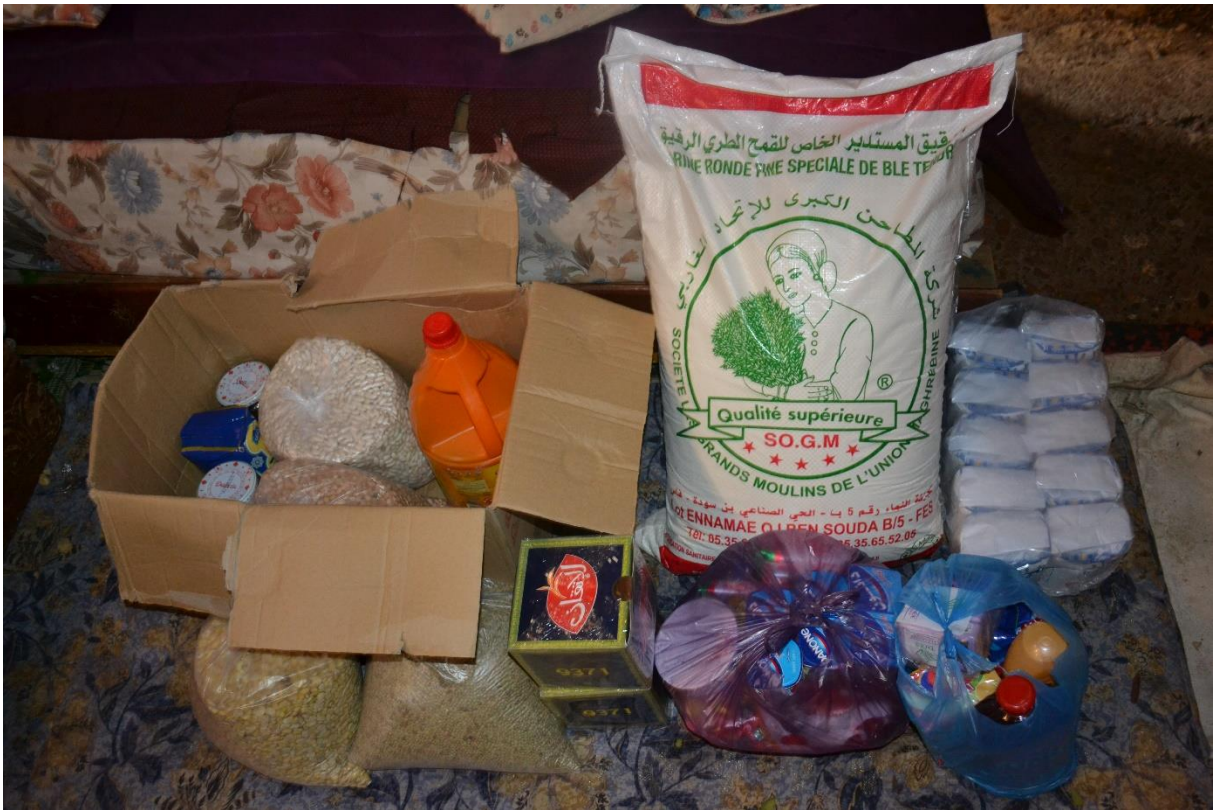
Figure 3: Example of distribution of food for poor families and elderly people

Goodwillers can give monthly donations to support families and elderly people without fixed income. We have received many requests in 2018, which we could not serve due to budget limitations, and we still receive many requests for urgent cases. We will appreciate a lot if you can support SNMV with monthly donations to serve this type of situations.