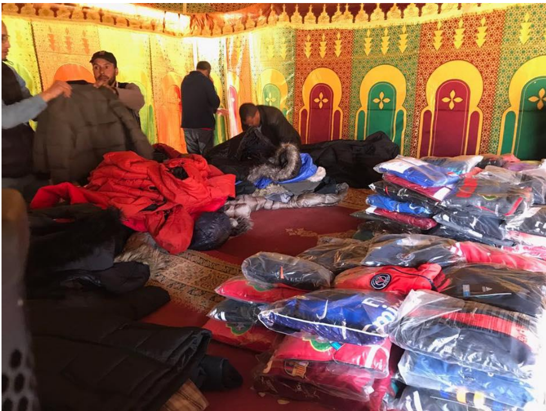
Figure 8: Preparation of the distribution of clothes to children at Sghour Rhamna