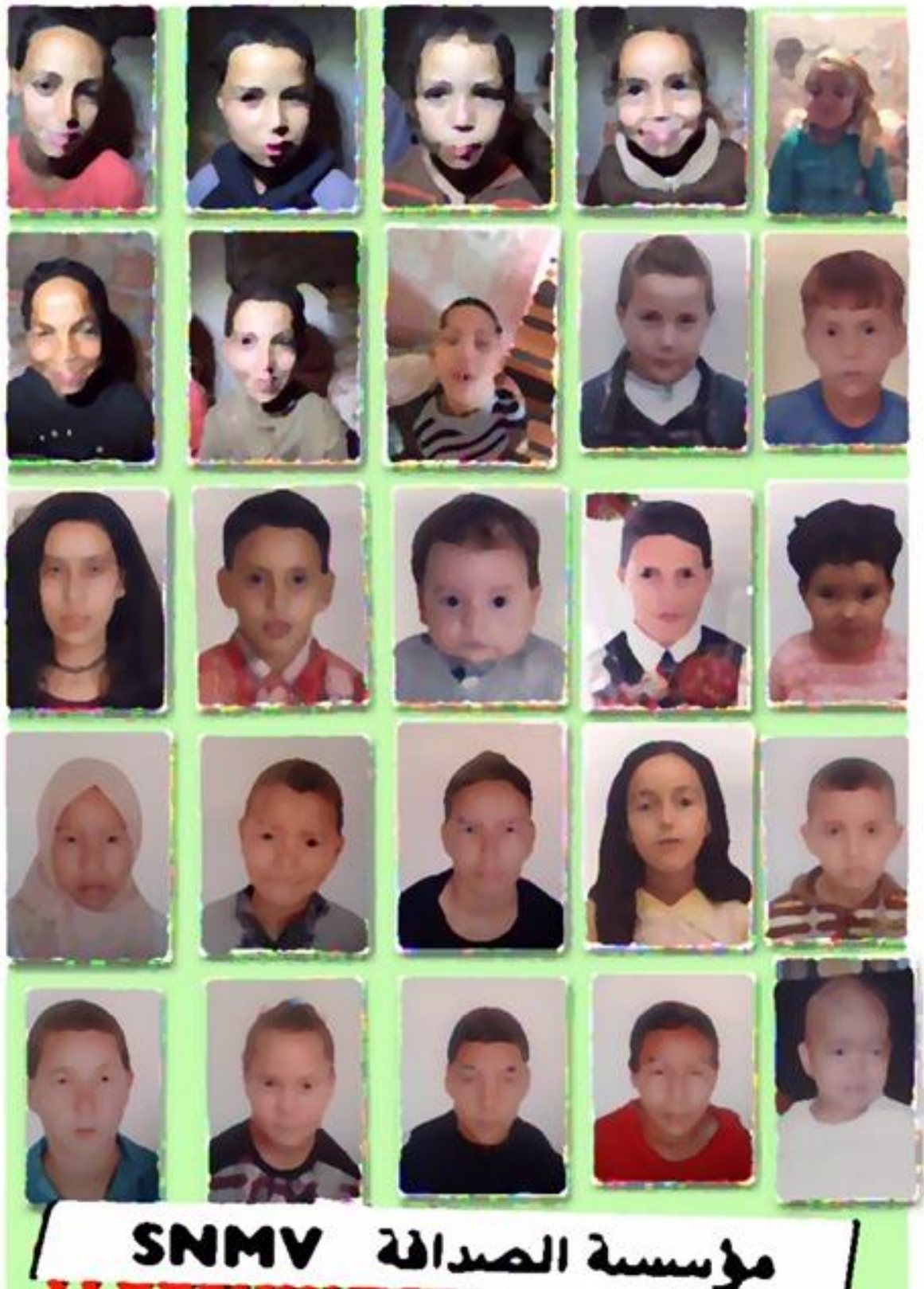
Figure 1: Example of list of orphans that SNMV supported in 2018 or are currently in waiting list, pictures have been manipulated for privacy reasons.