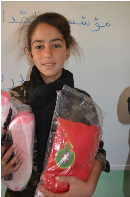
Figure 20: Example of smile and happiness