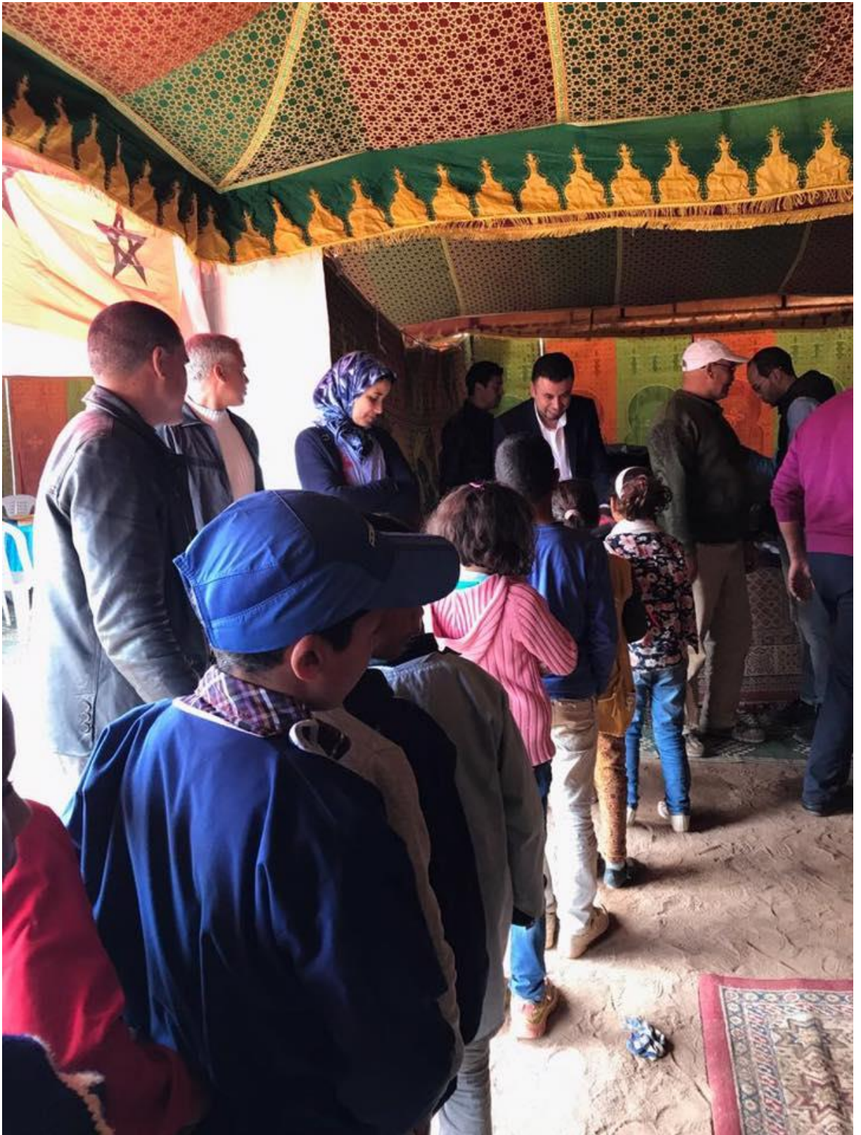
Figure 10: Distribution of clothes