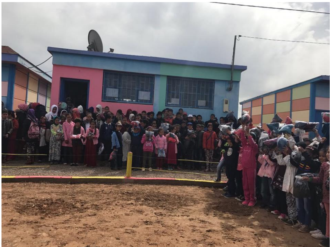
Figure 6: Basic school children at Oueld Lahcen