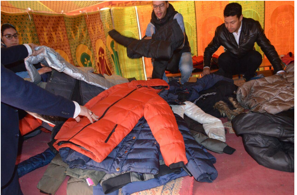
Figure 11: Selection of winter clothes depending on sizes and colors for children