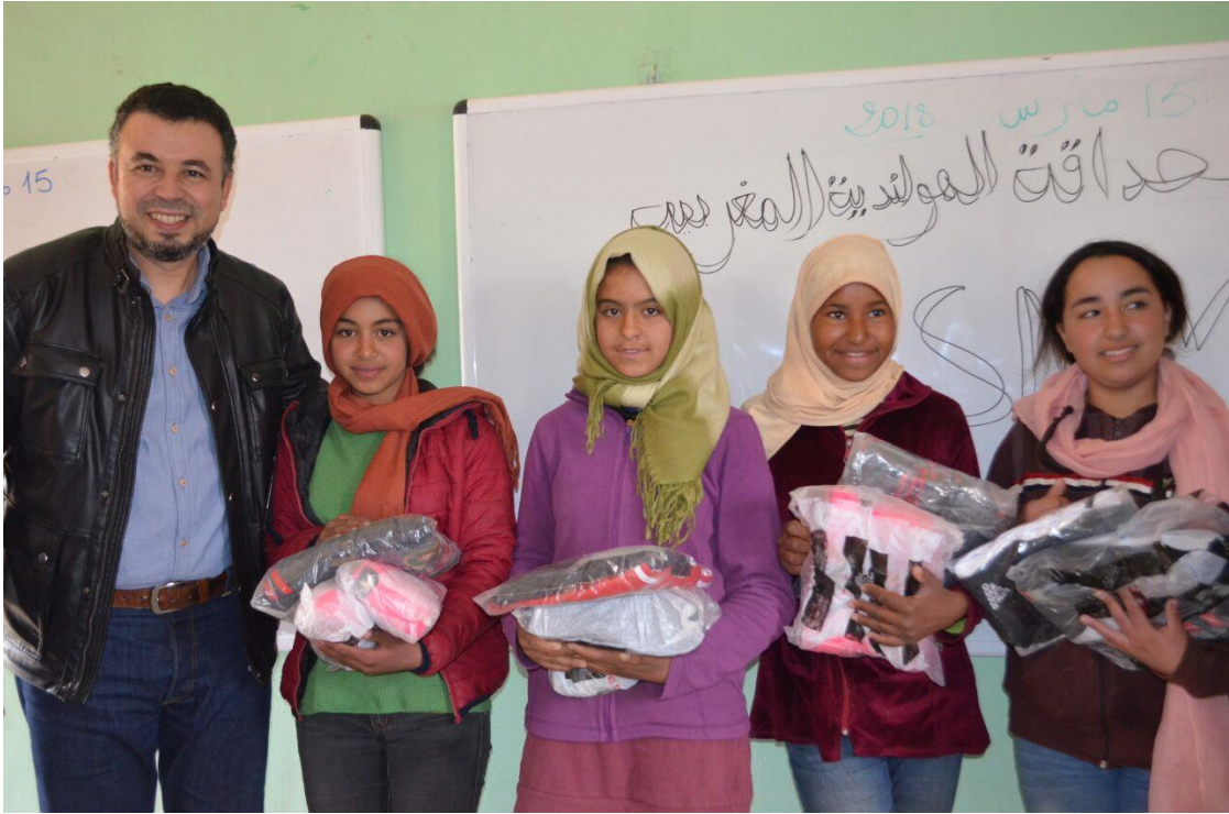
Figure 15: Bringing a smile to children of the atlas mountains