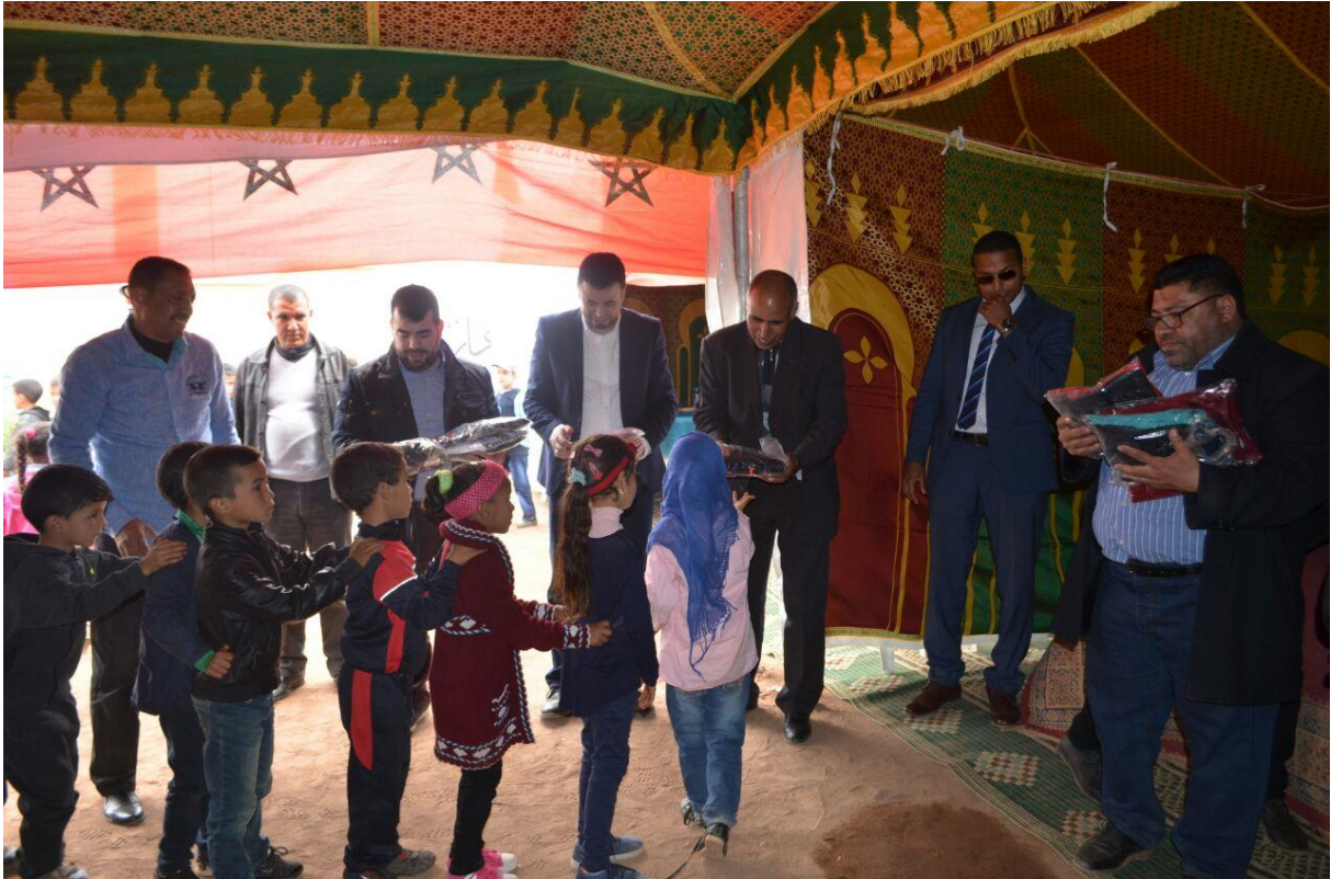
Figure 12: Distribution of clothes in presence of local authorities and director the school