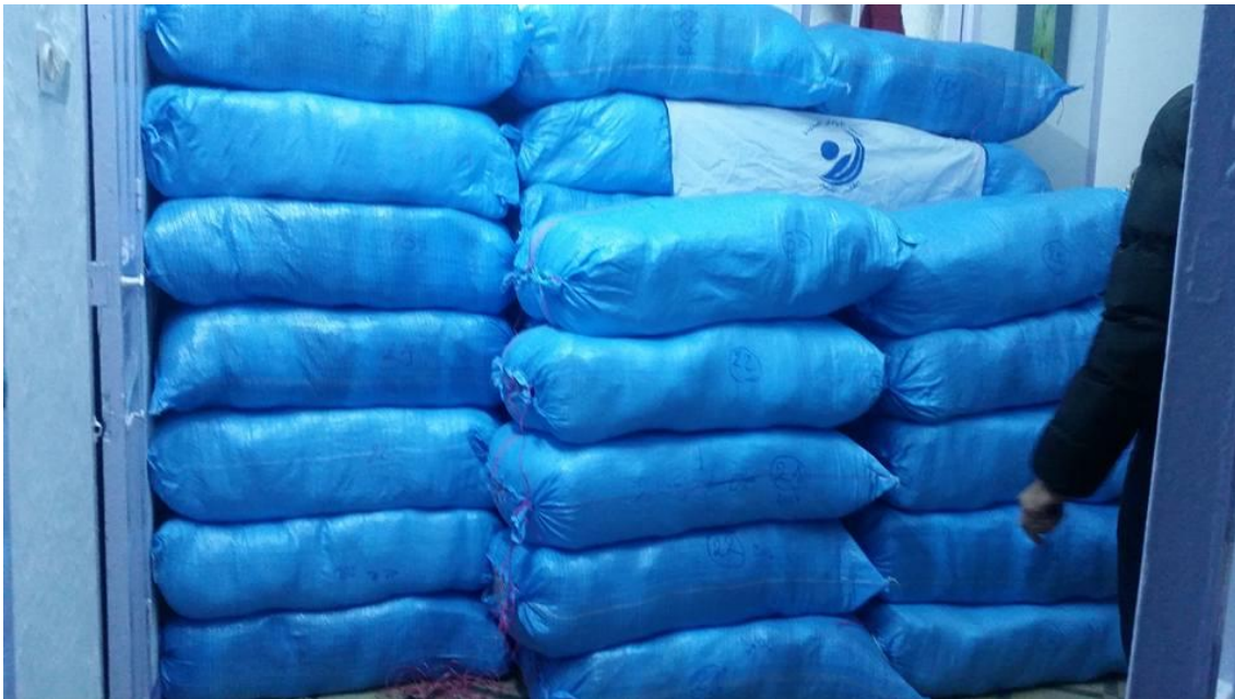
Figure 21: Example of set of clothes distributed in the atlas mountains

In the frame of supporting poors and needies at rural areas, we have supported families that are living the atlas mountains with winter clothes and shoes. In the winter season of 2018, we have supported persons living in the atlas mountains and in the province of Larache.