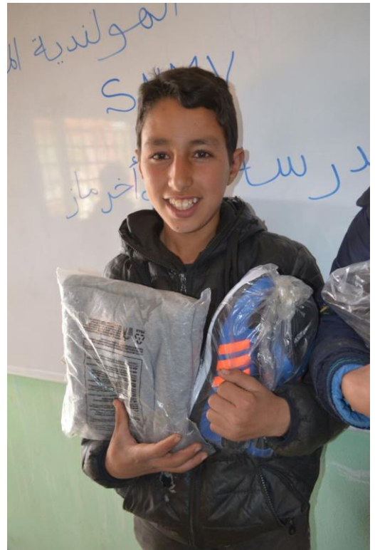
Figure 21: Example of smile and happiness