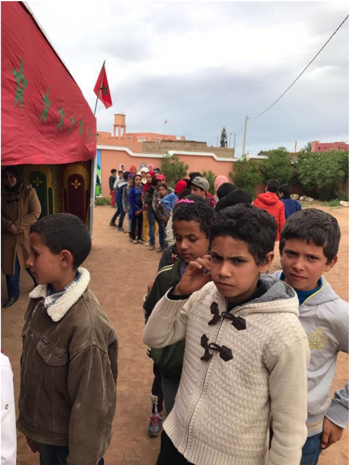
Figure 9: Distribution of the clothes to 350 children one by one