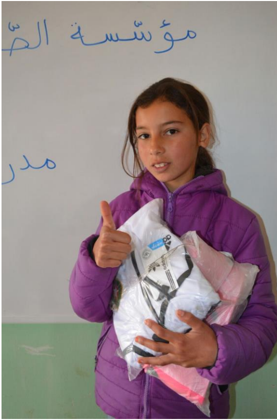
Figure 17: Example of smile and happiness