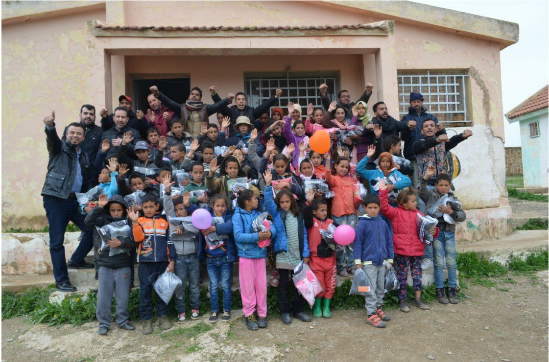
Figure 14: Final picture at the Atlas Mountain of school Boughermaz, children illustrates full enthusiasm and happiness