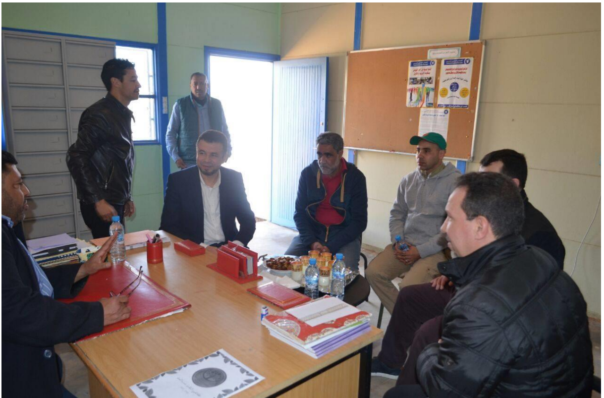
Figure 4: Meeting preparation for the educational project at Sghour Rhamna.

Figure 4 shows a picture of the meeting between SNMV, school director and teachers for the preparation of the project support for education at Ouled Lahcen school in Sghour Rhamna.