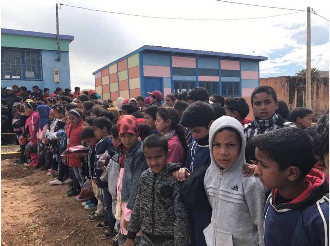
Figure 5: Picture illustrate the children at basic school at Oueld Lahcen